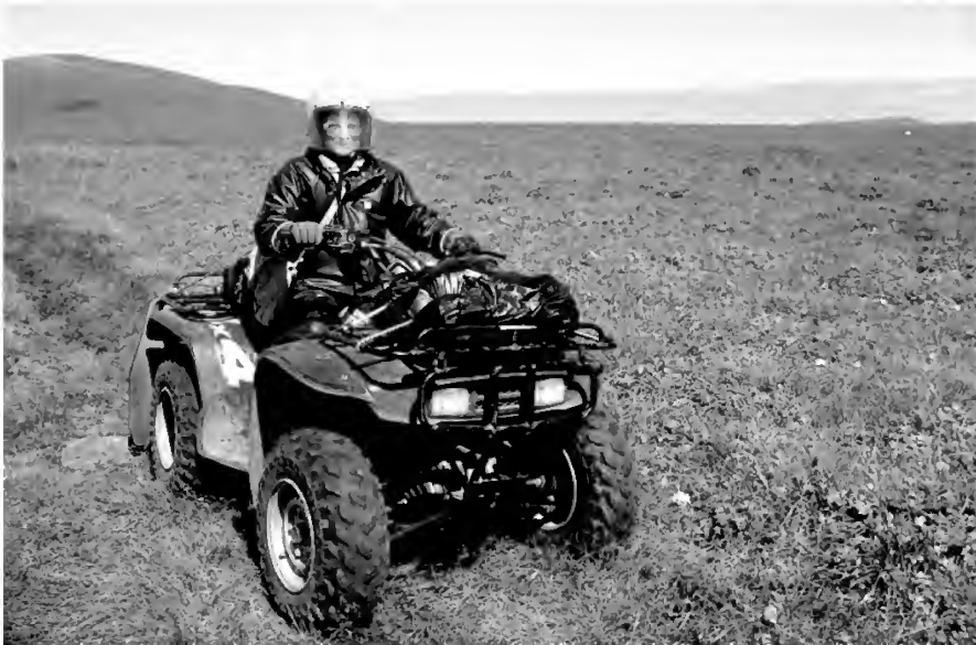
Four-wheelin'! St. Paul Island, Alaska, 1995.